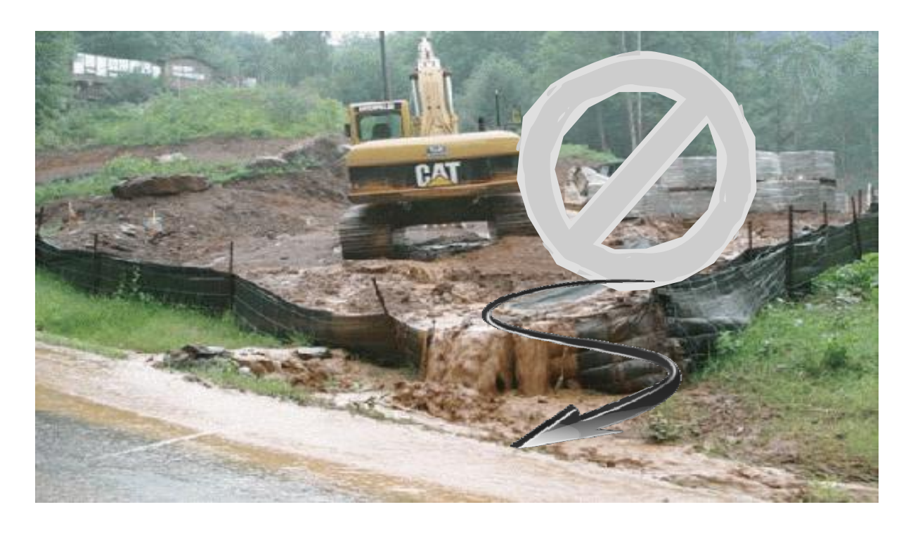
If you see an Illicit Discharge in Osceola County

Typically, you see large amounts of dirt on construction sites. These construction sites have permits and must keep all sedimentation on the construction sites and out of the stormwater system.