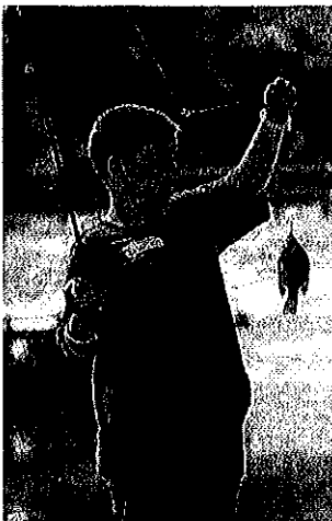
St. Cloud Parks and Recreation will host a youth fishing tournament March 17 at Barrow Park Pond across the street from St. Cloud Elementary School.

Using Your Sprinkler System Efficiently: 6-8 p.m. April 26: St. Cloud Civic Center, 3000 7th St., St. Cloud. Learn how to operate your sprinkler system control box and (or) basic sprinkler problems. Registration required. Free. 407-957-7344.