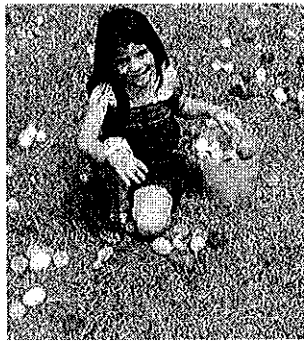
There will be a variety of Easter activities today-Saturday in Kissimmee and St. Cloud.

Sailing: Learn basic sailing skills and terminology from instructors of the Central Florida Community Sailing Program. The course consists of three weekly classroom sessions from 6:30-8:30 p.m. and three "on the water" Saturday sessions on Lake Babcock from 9 a.m.-1