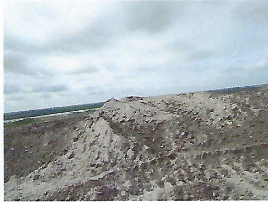
Pile of CCR