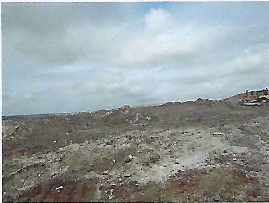
CCR disposal at landfill