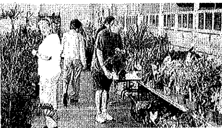
The Osceola County Master Gardeners' Spring Plant Sale will be Friday and Saturday at the KVLIS Pavilion at Osceola Heritage Park in Kissimmee.

Growing succulents: Topics include basic identification, some of the best varieties for Florida, care issues in the landscape and containers, and how to propagate. Everyone will try their hand at propagating and take a home a few. Registration required. 6 p.m. May 19, Maitland Community Park, 1400 Mayo Ave., Maitland, $10 per person.