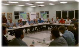
February 08, 2012 Meet and Greet with the Ranchers & APAFR Commander