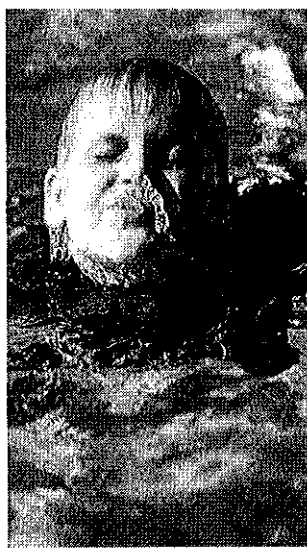
St. Cloud Parks and Recreation will host the event "S.O.S. - Splash for Our Kids' Safety" May 17 at the Chris Lyle Aquatic Center.

MAY 22 Tools to Quit Smoking class: Sponsored by the Florida Area Health Education Center Network and the Department of Health, Free carbon monoxide testing materials, and nicotine patches for participants (while supplies last). Advance registration required, 6-8 p.m. May 22, Crestwood Apartments, 301 Crestwood Circle, St. Cloud, free, 877-252-6094.