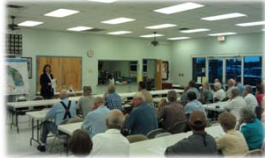
March 07, 2012 Community Meeting with the Ranchers, Residents, & APAFR Commander