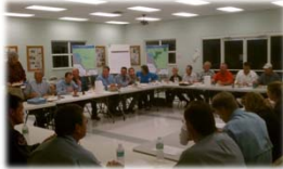
February 08, 2012 Meet and Greet with the Ranchers & APAFR Commander