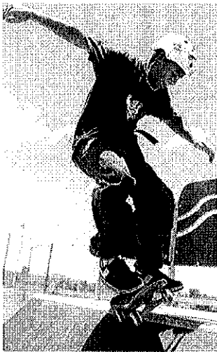
The City of Kissimmee will recognize International 'Go Skateboarding Day' by hosting a sports festival June 21 at Mark Durbin Community Park at Lakeside.

Summer vegetable gardening: Learn basic information about what to do in the vegetable garden in the summer, what vegetables do well and how to work with the season in Central Florida. Registration required. 6-7:30 p.m. June 12, Jessie Brock Community Center, 300 N. Dillard St., Orlando, $5 materials fee per household, 407-254-9200. Cloven School: Learn skills such as make up and costuming, balloon twisting,